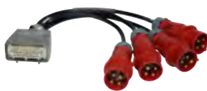
PLA-34-01 Break-in Cee-form to Harting, Direct Control Adapter to connect a multi cable to 4 motor cables. 4 x 4p. Male CEE connector to female HARTING connector.