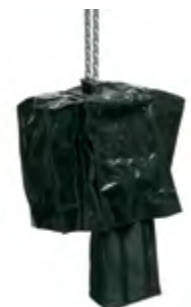
PLA-50-007 Raincover 1000kg hoist double reeved