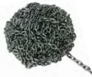
PLS-10-002 Chain 4X12,2mm/m (250Kg hoists)