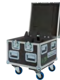
PAE-A-FC500 Flightcase 500kg hoist