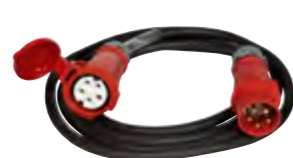
PLA-32-05 Powercable 32A/400V/5p Mains cable 32A, CEE 5p. To be used to connect your controls to the power system. Available in several lengths.