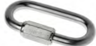
PLA-10-008 QUIK LINK 6MM, ELV. FOR CHAINBAG. Quick connection link to connect the chainbag safely to the chainbag bracket.