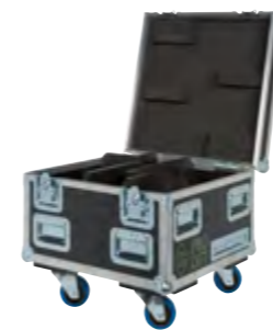
PLA-40-001 Flightcase 250kg hoist