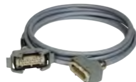
PLA-33-05 Multi cable, 16p. HARTING To be used to connect up to 4 hoists - in combination with the 4-way break-out or break-in. Available in several lengths.