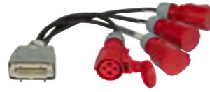
PLA-34-02 Break-out Harting to Cee-form, Direct Control Adapter to connect 4 motor cables to a multi cable. Male HARTING connector to 4 x 4p. female CEE connector.