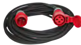
PLA-30-05 Powercable 16A/400V/4p Motor cable 16A, CEE 4p. To be used for direct controlled hoists. Available in several lengths.