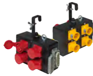
PLA-34-04 Break-out Harting to Cee-form, Low Voltage Control Adapter to connect 4 motor cables to a multi cable. Male HARTING connector to 4 x 4p. female CEE connector. For low voltage hoists.