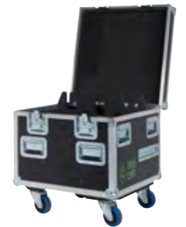
PAE-A-FC1000 Flightcase 1000kg hoist