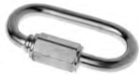
PLA-10-006 QUIK LINK 4MM, ELV. FOR CHAINBAG. Quick connection link to connect the chainbag safely to the chainbag bracket.