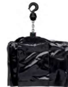
PLA-50-003 Raincover 1000kg hoist single reeved