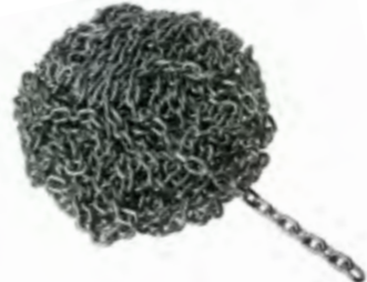
PLS-12-002 Chain 5,0x15,1mm/m (500Kg hoists)