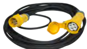
PLA-31-05 Control Cable Low Voltage Hoists 6A, CEE 4p. To be used for low voltage controlled hoists. Available in several lengths.