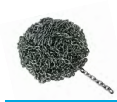
PLS-12-002 Chain 5,0x15,1mm/m (500Kg hoists)