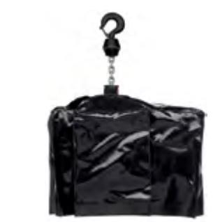
PAE-A-FC500 Flightcase 500kg hoist

PLA-50-003 Raincover 1000kg hoist single reeved