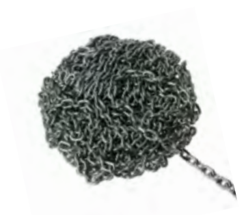
PLS-10-002 Chain 4X12,2mm/m (250Kg hoists)