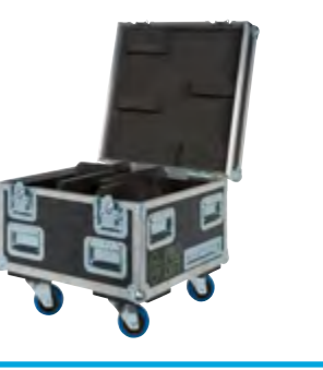
PLA-40-001 Flightcase 250kg hoist

PLA-34-04 Break-out Harting to Cee-form, Low Voltage Control Adapter to connect 4 motor cables to a multi cable. Male HARTING connector to 4 x 4p. female CEE conector. For low voltage hoists.