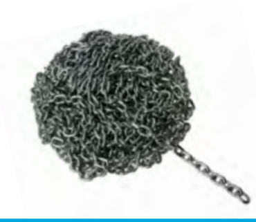
PLS-11-002 Chain 7,1x20,5mm/m (1000Kg hoists)