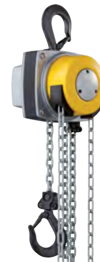
PHC-500RHG-0315 PHC-1000RHG-0315 Manual Chain Hoists 500kg and 1000kg rotating hand chain guide