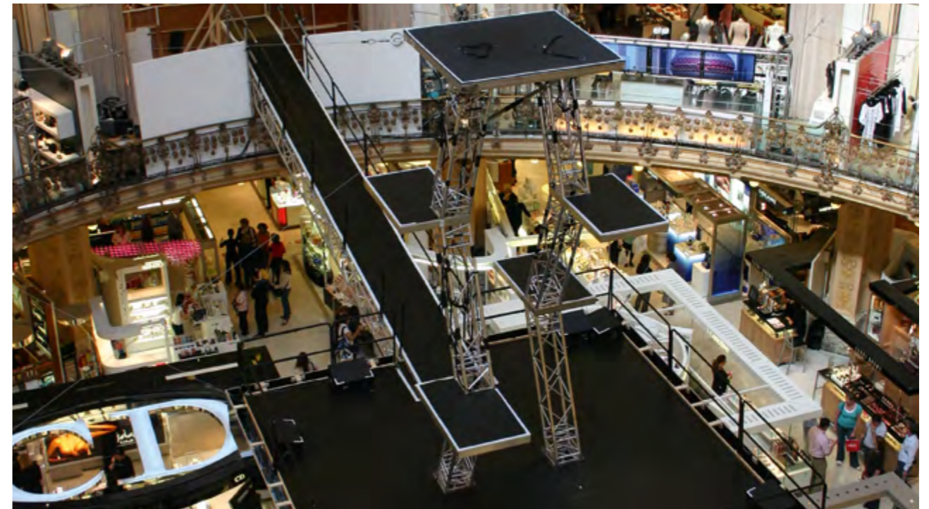
Project Galleries Lafayette

StageDex is based on a special extruded aluminium profile. The top board is glued to the frame to reduce noise and vibration. All decks are available in metric and imperial sizes.