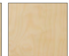
SM-DL-C Birch plywood, clear varnish, indoor use only