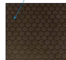
SM-D-T Birch plywood non slid top layer, non permanent outdoor use