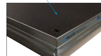
Topline frame, reinforcement corner