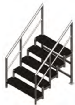
Typical step unit configuration

plan incremental investments in the system, confident that they will be able to offer step configurations to suit every eventuality.